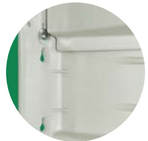
Preset Key Holes

New and Improved Model... Now features high-density polyethylene molded inserts — the same maintenance-free material as the wells — which add strength and rigidity to withstand adverse freeze/thaw and settling conditions while simplifying the backfilling process.