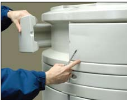
Remove inserts from lower module

New and Improved Model... Now features high-density polyethylene molded inserts — the same maintenance-free material as the wells — which add strength and rigidity to withstand adverse freeze/thaw and settling conditions while simplifying the backfilling process.