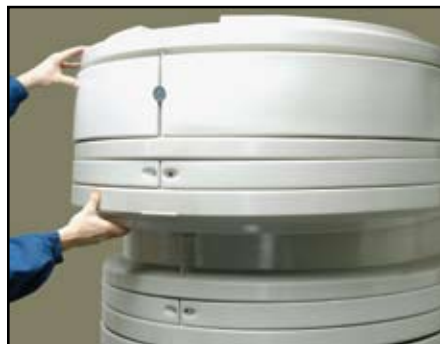
Slide and mate modules together