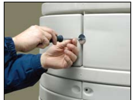
Lock to form a cohesive assembly